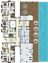
First floor plan block 06